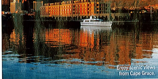
Enjoy scenic views from Cape Grace.

In the mood to party? Try a nightspot like Hemisphere , where you'll catch mountain views and cityscapes as you groove to